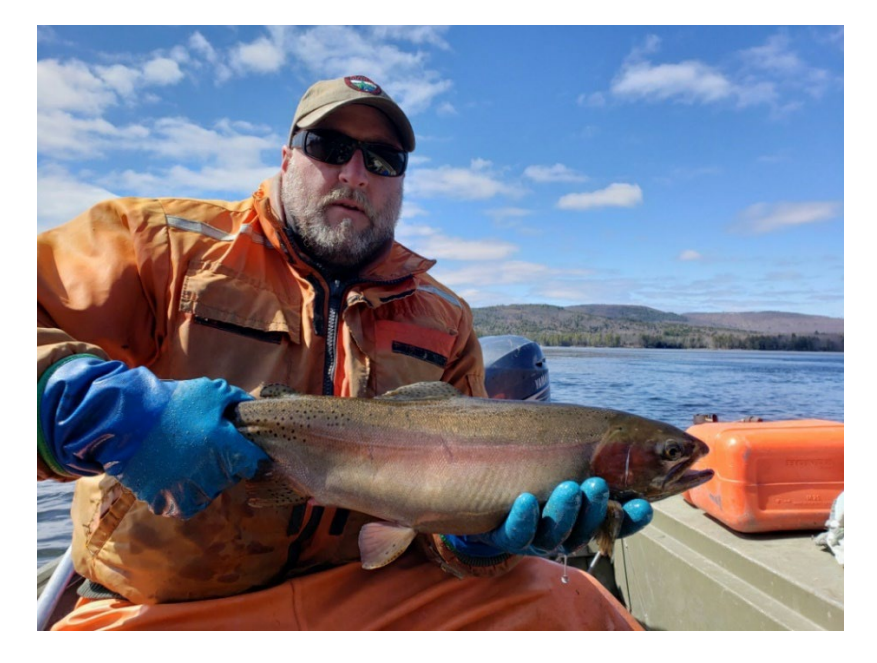
Figure 4. One of the Rainbow Trout Collected in 2022.

in 2019. While more rainbow trout were collected using the gillnets (N=4), the sample size remained too small to make informed decisions regarding the success of the program.